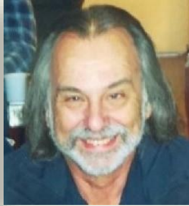
Working from home