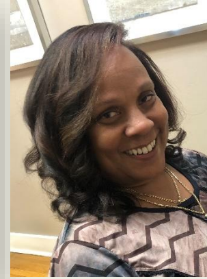
Working from home