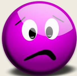
Vacant Electrical P.E.