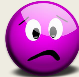
Vacant Growth Management & Legislative Liaison