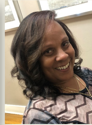
Result of working from home