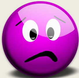
Vacant Electrical P.E.