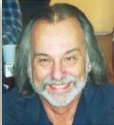
Result of working from home